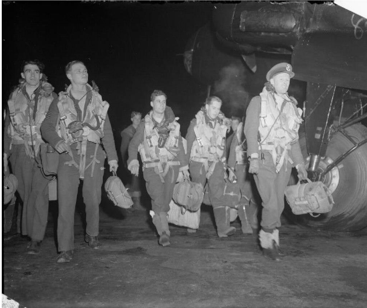
Halifax crew heads to debriefing.